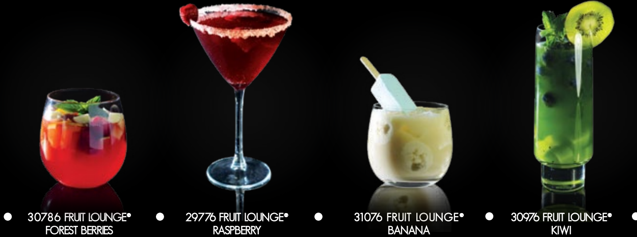
● 30786 FRUIT LOUNGE® FOREST BERRIES ● 29776 FRUIT LOUNGE® RASPBERRY ● 31076 FRUIT LOUNGE® BANANA ● 30976 FRUIT LOUNGE® KIWI ●