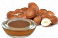
51446 Hazelnut Paste (Dark Roasted Hazelnut)