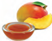
47746 Mango Compound