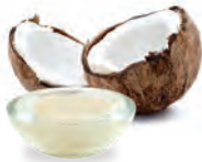
89846 Coconut Compound

PreGel's 5-Star Chef Pastry Select™ line caters directly to the unique needs of top pastry chefs and professionals around the world. The pastes, compounds and fillings featured in the line are sourced from the best regions around the world, represent the highest quality available in the market and provide authentic flavors for pastries of all kinds. The products are sold both direct and through our distributor partners around the country.