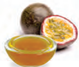
46046 Passion Fruit Compound