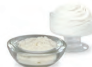
311008 Pastry Gelatin Base