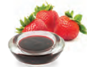
82006 Strawberry Compound