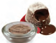
312038 Molten Chocolate Cake