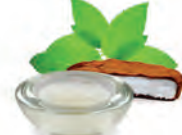
59846 White Mint Compound

LE BERET DESSERT BY CHEF FREDERIC MONTI, FEATURING COCONUT COMPOUND AND PASSION FRUIT COMPOUND