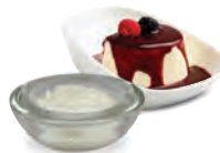
83514 Pronto Pannacotta (Cooked Cream)