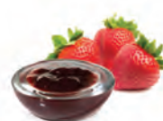
23422 Strawberry Filling