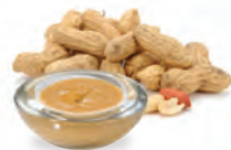
24546 Peanut Paste