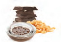
55342 Milk Chocolate Crunch Filling