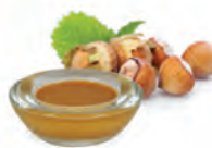
51546 Hazelnut Superior Paste (Premium Light Toasted Hazelnut)