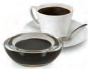
89846 Coffee Compound