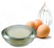
71904 Albumissimo (Egg White Base)

The PreGel 5-Star Chef Pastry Select™ Pronto Pastries line features instant products that are designed for chefs in need of superior dessert solutions prepared in half the time. From instant pannacotta to molten chocolate cake, the powdered formulas are so revolutionary they are virtually indiscernible from scratch-made desserts.