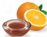
78046 Orange Compound