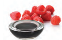
85846 Raspberry Compound